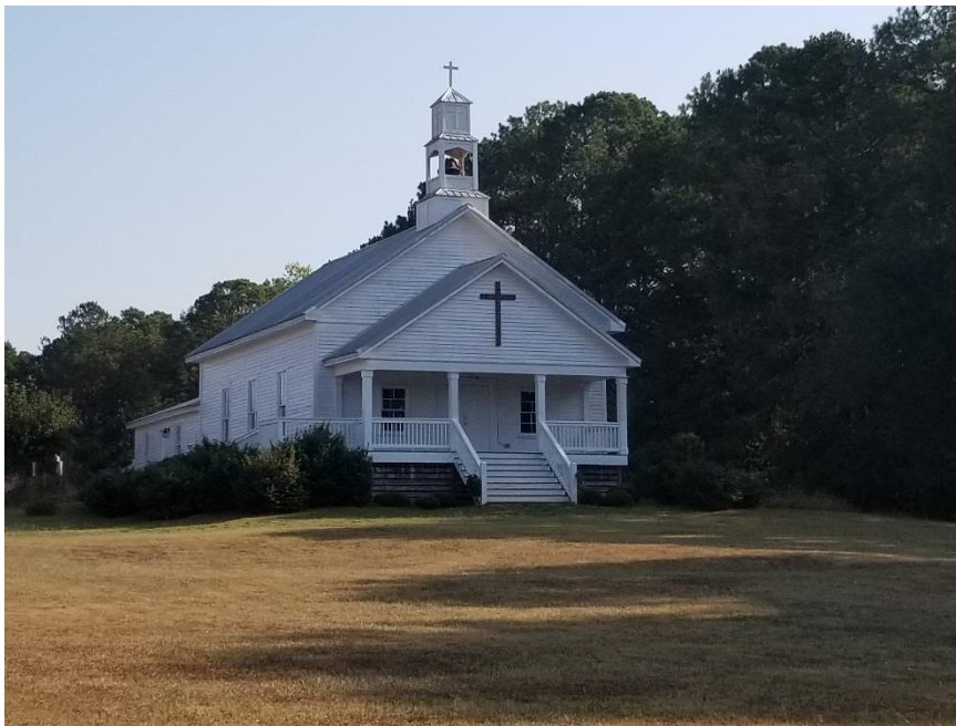
The relocated and remodeled church building at the current location. The applicant and builder did a fine job with moving and remodeling the church, even if it is a little more ornate than the original building. Given the choice of moving or losing one of Morgan County's historic churches, Planning staff joined the MMC and the community in celebrating a preservation victory.