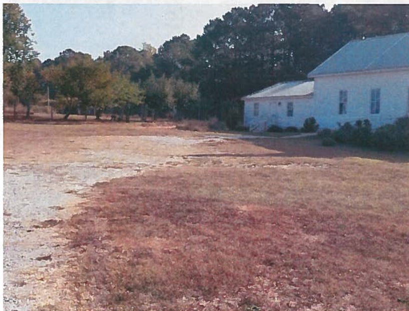
A view of the current parking area for the church, showing the handicapped parking space.

exemption. The occupant load for the church is 160 persons, which would require 40 parking spaces, including 2 handicapped parking spaces. The Planning Commission may recommend to the Board of Commissioners that a variance be extended to the applicant because of the history of the church, which would set a precedent for parking lots and historic, relocated church buildings.