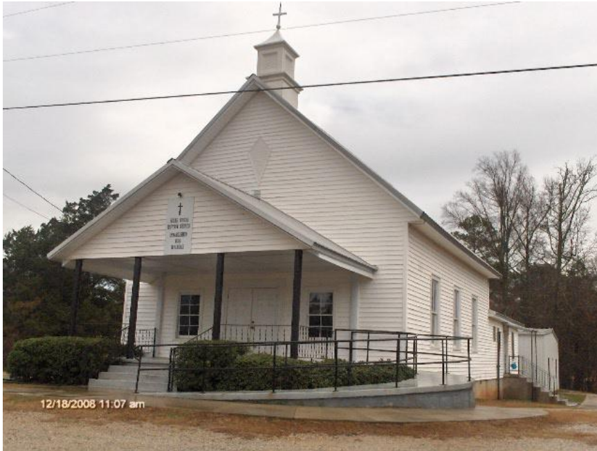
The Sugar Creek Baptist Church in 2006 when it was located at the corner of Sugar Creek Church Road and Highway 278.