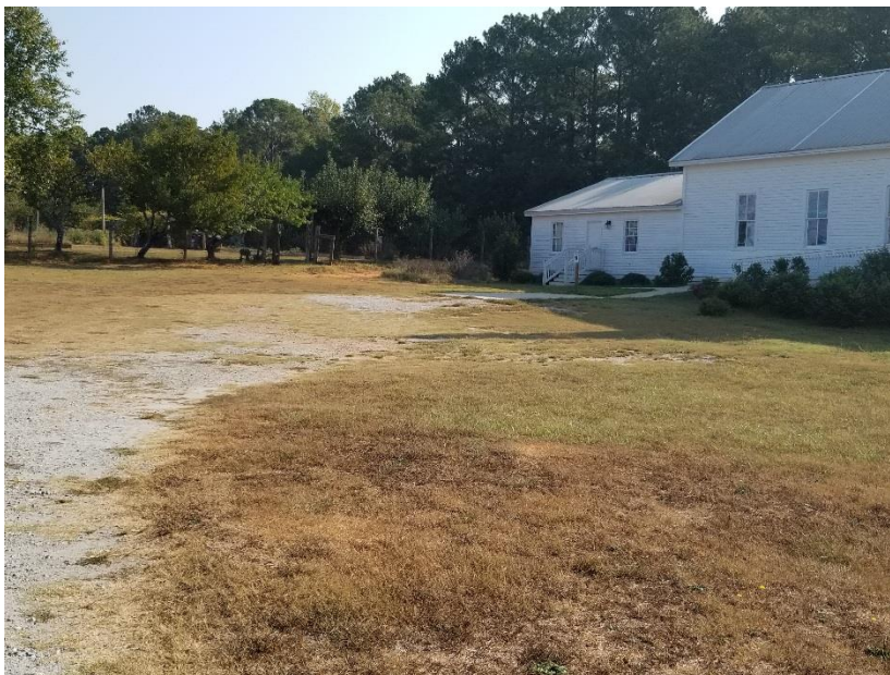
A view of the current parking area for the church, showing the handicapped parking space.

exemption. The occupant load for the church is 160 persons, which would require 40 parking spaces, including 2 handicapped parking spaces. The Planning Commission may recommend to the Board of Commissioners that a variance be extended to the applicant because of the history of the church, which would set a precedent for parking lots and historic, relocated church buildings.