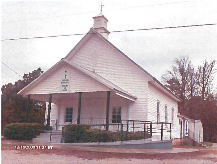
The Sugar Creek Baptist Church in 2006 when it was located at the corner of Sugar Creek Church Road and Highway 278.